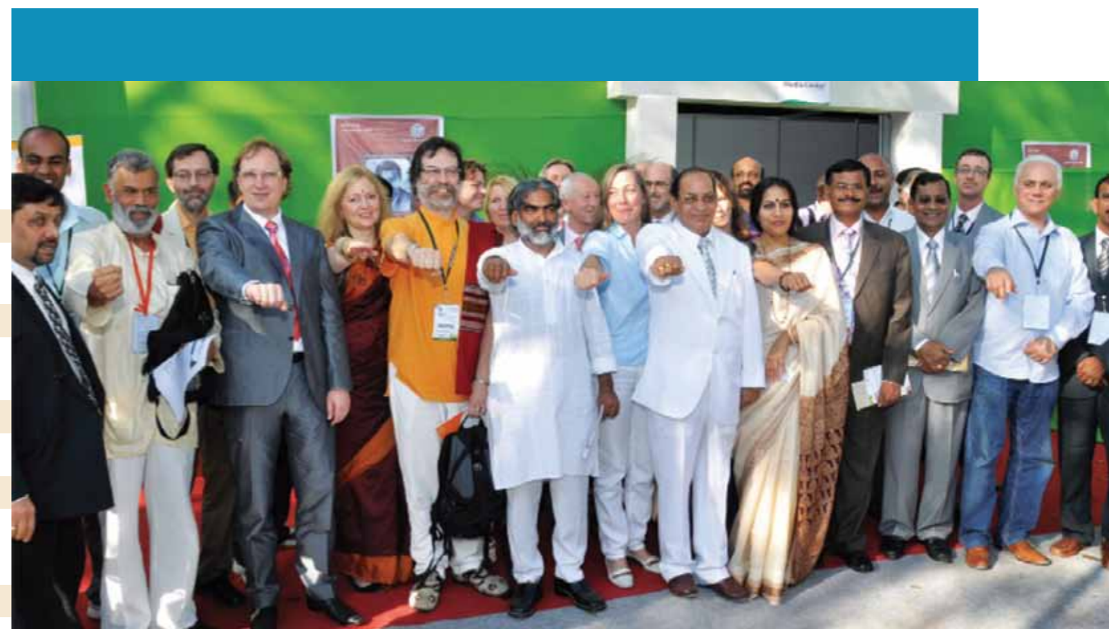
‘Global Pledging for Ayurveda’ during the World Ayurveda Congress to promote Ayurveda worldwide.