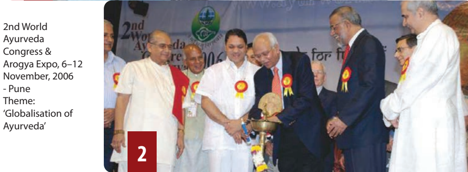
2nd World Ayurveda Congress & Arogya Expo, 6–12 November, 2006 - Pune Theme: 'Globalisation of Ayurveda'