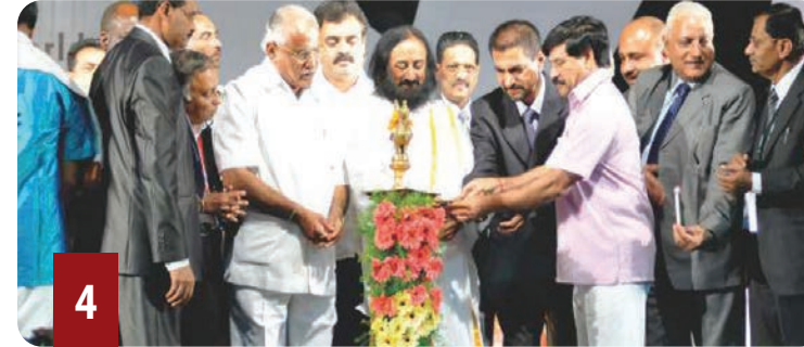
4th World Ayurveda Congress & Arogya Expo, 9–13 December, 2010 - Bengaluru Theme: 'Ayurveda for all'