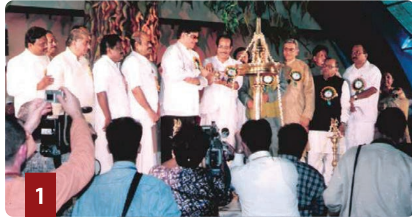
1 st World Ayurveda Congress & Arogya Expo, Kochi 30 October–4 November 2002 Theme: 'Ayurveda & World Health'