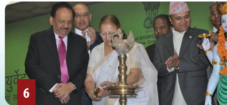
6th World Ayurveda Congress & Arogya Expo 6–9 November, 2014, Delhi Theme: 'Health Challenges and Ayurveda'