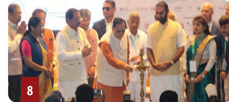
8th World Ayurveda Congress & Arogya Expo, 14–17 December 2018, Ahmedabad Theme: Re-aligning the Focus on Health