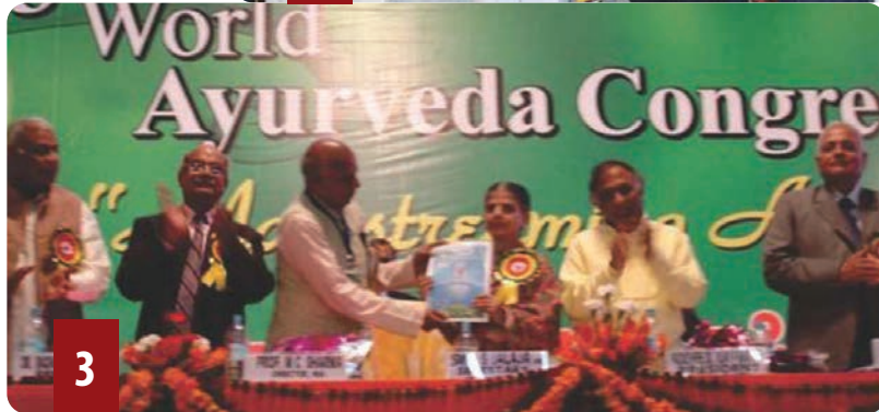
3rd World Ayurveda Congress & Arogya Expo, 16–21 December, 2008 - Jaipur Theme: 'Mainstreaming Ayurveda'