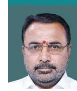
Shri Prataprao Ganpatrao Jadhav Minister of State, (Independent Charge) Ministry of AYUSH & Ministry of Health and Family Welfare