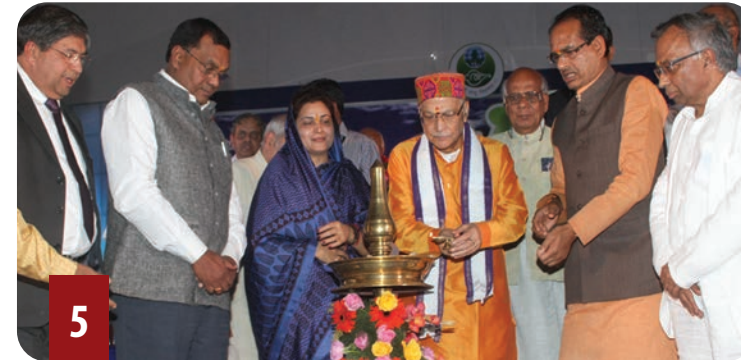
4 th World Ayurveda Congress & Arogya Expo, 9-13 December 2010 - Bengaluru Theme: 'Ayurveda for all'