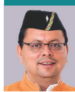
Shri Pushkar Singh Dhama Chief Minister of Uttarakhand

MINISTER'S BLOCK, SECRETARIAT COMPLEX, PORVORIM, UTTARAKHAND , 403 521, INDIA PH: 0832-2419841/42 FAX: 0832 2419840/46 Email: cm.goa@nic.in