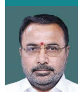
Shri Prataprao Ganpatrao Jadhav Minister of State, (Independent Charge) Ministry of AYUSH & Ministry of Health and Family Welfare