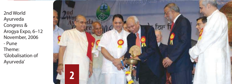
2nd World Ayurveda Congress & Arogya Expo, 6-12 November, 2006 - Pune Theme: 'Globalisation of Ayurveda'