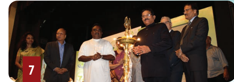
7th World Ayurveda Congress & Arogya Expo, 1-4 December, 2016 - Kolkata Theme: Strengthening the Ayurveda Eco Systems